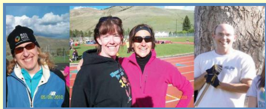
A few fearless leaders

Thank you for helping Missoula children stay active and become involved in the sport of track and field.