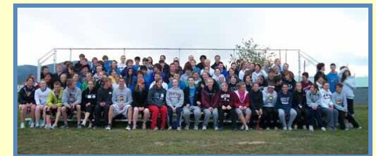
Our amazing coaches!